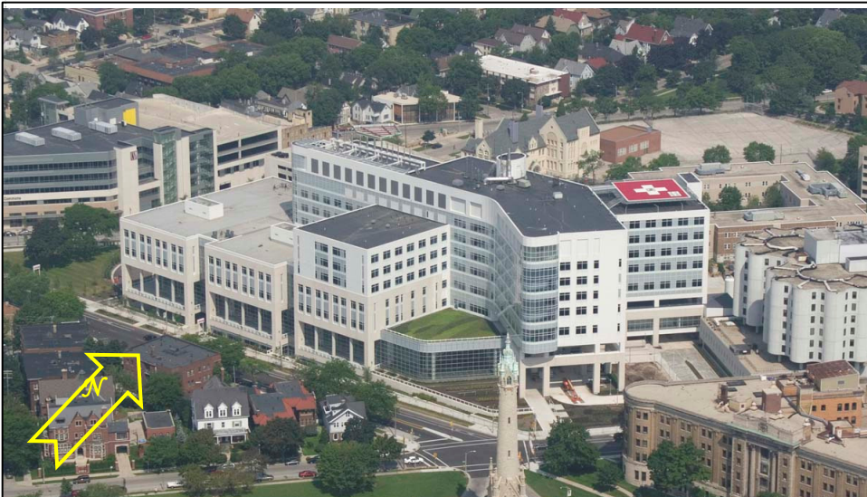
Milwaukee, WI St Mary's Hosp (WS03) 43°03'42"N 87°52'45"W IMPORTANT: The pilot retains full responsibility for safe and legal flight operations, regardless of data presented on this page.